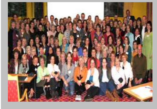
ICPPMH at the Conference in Bergen 2008.