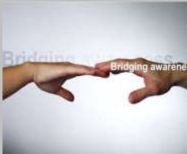
IOPTMH Reaching Mental Health Physical Therapy across borders